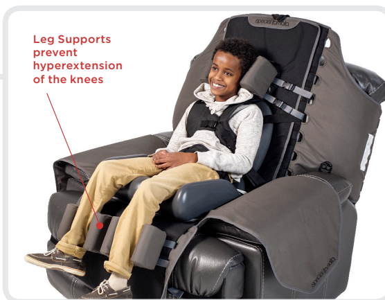
Shown with optional seat & back liners