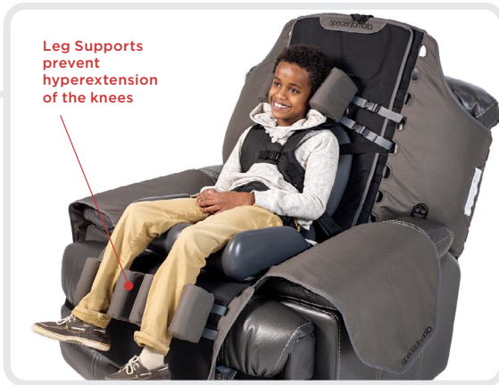
Shown with optional seat & back liners