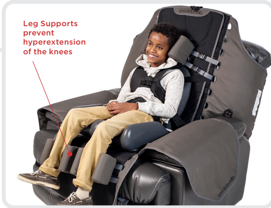
Shown with optional seat & back liners