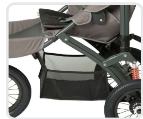
Medical Necessities Bag