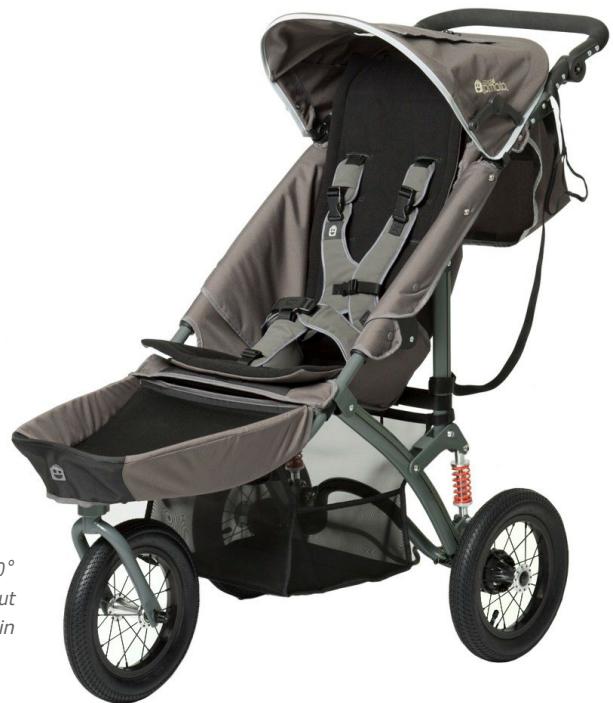
Front wheel rotates 360° and includes lock-out pin for rough terrain