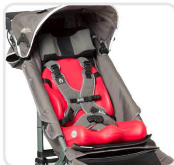
Soft-Touch Liners and Padded Headrest