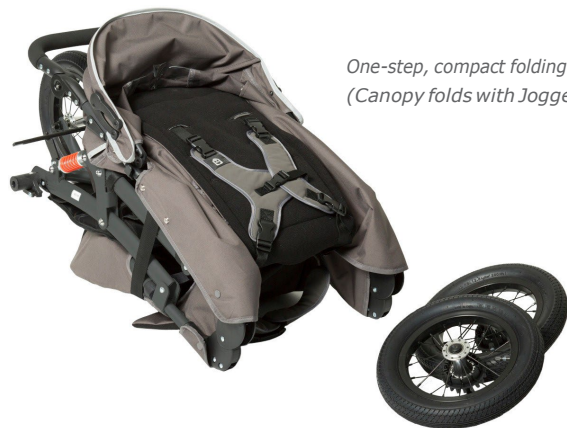
One-step, compact folding design (Canopy folds with Jogger)