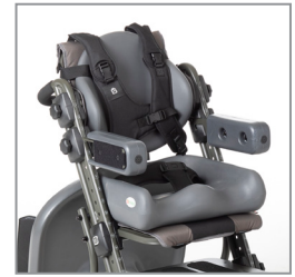
60030109 / 60030209