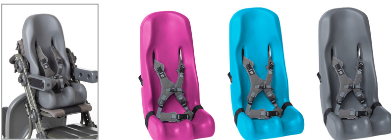
Shown with size 3 Soft-Touch® Sitter