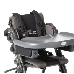
60020109 / 60020209