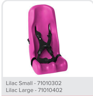
Lilac Small - 71010302 Lilac Large - 71010402