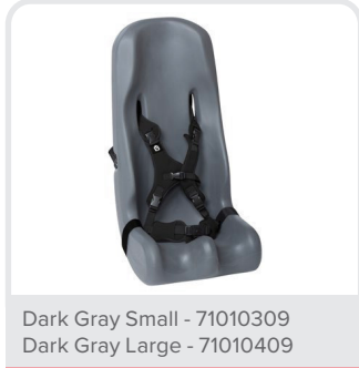
Dark Gray Small - 71010309 Dark Gray Large - 71010409