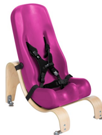
Soft-Touch® Booster Car Seat™ shown w/ Stationary Base