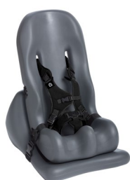
Soft-Touch® Booster Car Seat™ Small ONLY w/ Floor Base