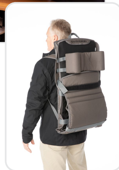
Ready for travel as a backpack