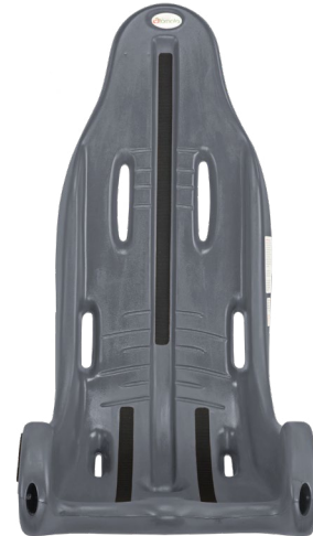
Large Shell (ML)

Choose a Shell size to determine your options