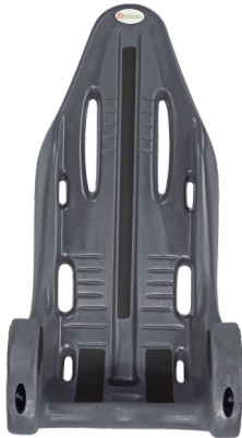
Small Shell (MS)