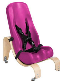
Soft-Touch® Booster Car Seat™ shown w/ Stationary Base