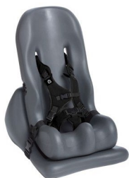
Soft-Touch® Booster Car Seat™ Small ONLY w/ Floor Base